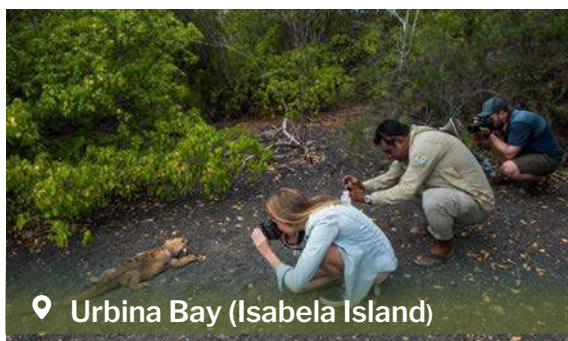
📍 Urbina Bay (Isabela Island)

At the far end of a long level hike, we arrive at a strange phenomenon where large blocks of coral lie completely exposed after a dramatic geological uplift in 1954. Located at the western base of Alcedo Volcano, we hope to run into a few impressive land iguanas and some volcanoes endemic to Galapagos giant tortoises during the wet season. Landing: wet