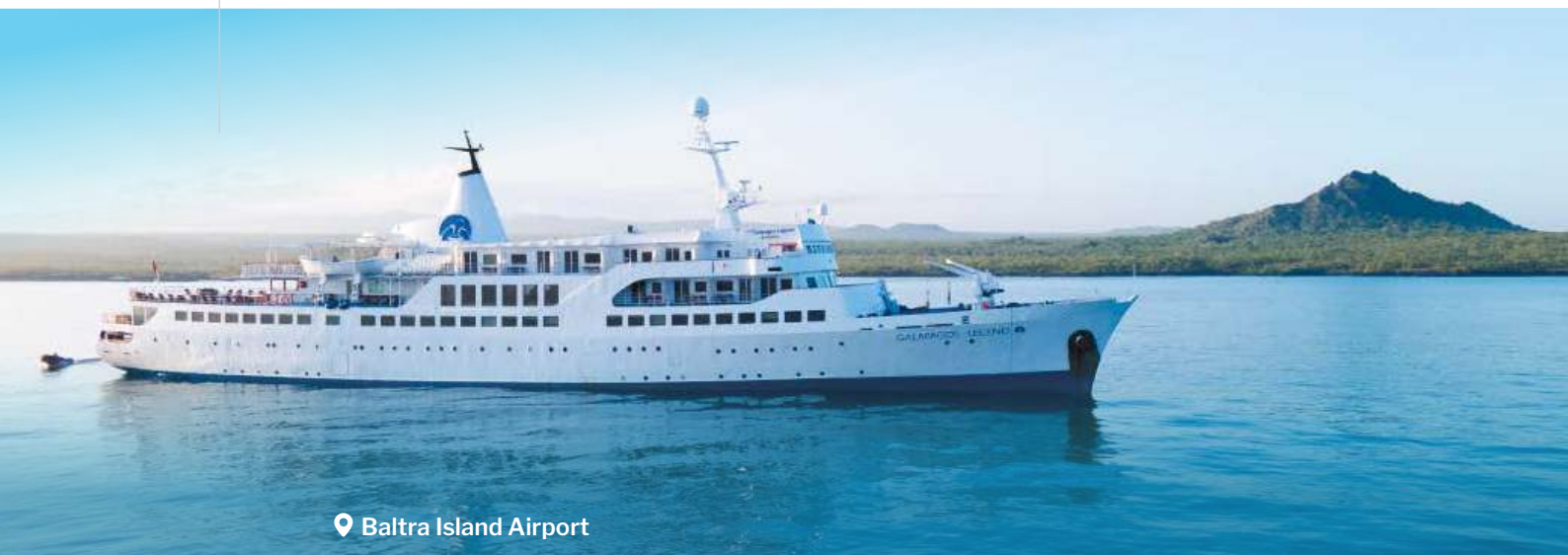
📍 Baltra Island Airport

After the visit, passengers will be transferred to the airport for their return flight to Guayaquil or Quito.