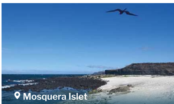
📍 Mosquera Islet

This tiny, low-lying islet, converted into coral sand, is set between the north and south Seymour Islands. It's home to a group of sea lions that come to laze on the soft white sand, it's an excellent spot to observe shorebirds, herons, lava gulls, and boobies. Snorkeling or diving here, one can often see sharks, rays, and barracudas. Landing: dry