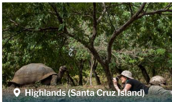
📍 Highlands (Santa Cruz Island)

In the central highlands of Santa Cruz Island, we have our best opportunity to interact at close quarters with totally wild, Galapagos giant tortoises. A short walk among these huge, 600lb, reptiles will also offer the chance for more highland species, especially several species of the famed finches. Landing: dry