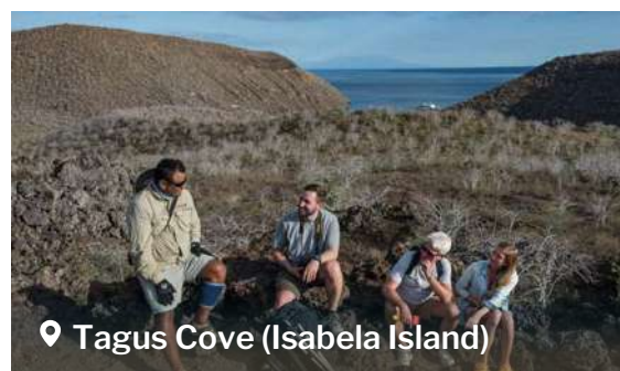
📍 Tagus Cove (Isabela Island)

Tagus Cove, a historic pirate hideout and anchorage. Visited by Charles Darwin and the HMS Beagle in 1835. Hike past Darwin Lake and stunning volcanic landscape, revealing Isabela island's dramatic northern volcanoes. Snorkel along a submerged wall with turtles, fish, penguins, and flightless cormorants. Enjoy a panga ride or kayak for added excitement! Landing: dry