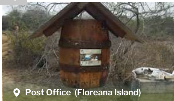
📍 Post Office (Floreana Island)

Post Office (Floreana Island). The famous Post Office Barrel. Claimed to have been first set up in 1793 by Captain James Colnett. The system involved whalers and fur sealers would leave addressed letters in the barrel to be picked up by homeward-bound colleagues. Actually visitors often take letters and handdeliver them to their home countries. Landing: wet