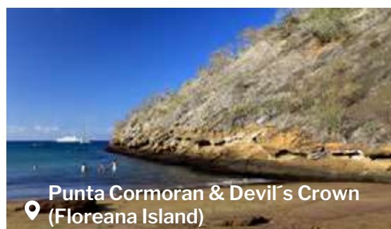
📍 Punta Cormoran & Devil's Crown (Floreana Island)

Our walk takes us to a large, shallow lagoon, often inhabited by a variable number of shockingly pink greater flamingos. We arrive at a powdery white beach, a nesting area for green turtles. Devil's Crown is one of the favorite snorkeling sites on the islands. Landing: dry