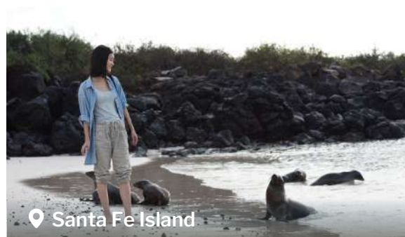
📍 Santa Fe Island

After a fabulous snorkel in the turquoise waters of the protected bay, we may have enjoyed time with sea lions, turtles, reef sharks and spotted eagle rays. Landing on a sandy beach, we spend time watching the abundant sea lions there with us and . We begin a walk past a forest of island-endemic giant Opuntia cacti and we can watch the Santa Fe land Iguana. Landing: wet