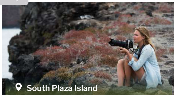
📍 South Plaza Island

Sea lions, swallow-tailed gulls, and land iguanas are all present at the landing site. The small island is covered with a carpet of a red succulent studded with Opuntia cacti. At the cliff edge, we spend time watching birds like frigatebirds, flocks of Galapagos shearwaters, and of particular note, flights of displaying red-billed tropicbirds. Landing: dry