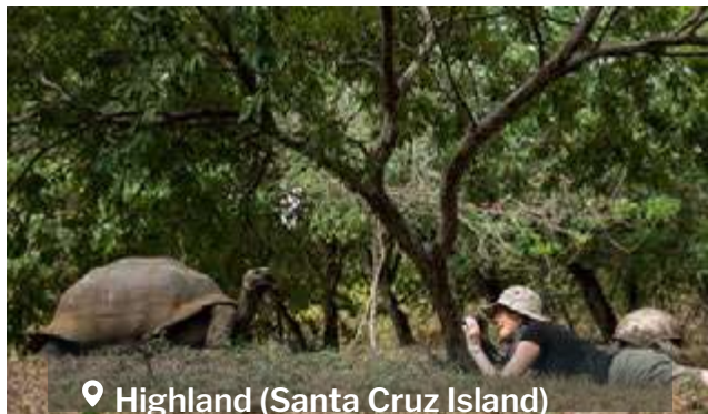
📍 Highland (Santa Cruz Island)

In the central highlands of Santa Cruz Island, we have our best opportunity to interact at close quarters with totally wild, Galapagos giant tortoises. A short walk among these huge, 600lb, reptiles will also offer the chance for more highland species, especially several species of the famed finches. Landing: dry