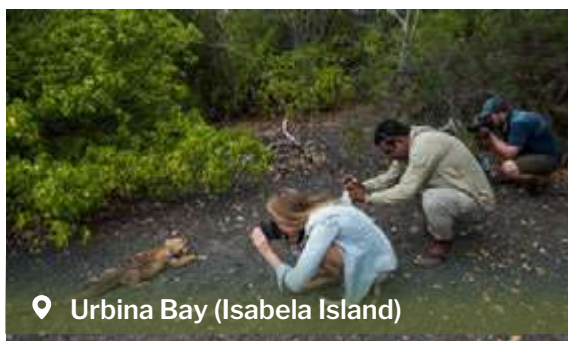
📍 Urbina Bay (Isabela Island)

At the far end of a long level hike, we arrive at a strange phenomenon where large blocks of coral lie completely exposed after a dramatic geological uplift in 1954. Located at the western base of Alcedo Volcano, we hope to run into a few impressive land iguanas and some volcanoes endemic to Galapagos giant tortoises during the wet season.