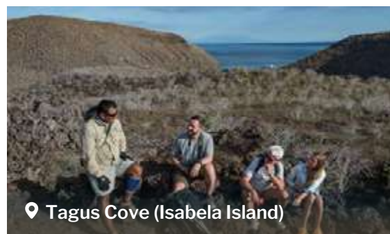
📍 Tagus Cove (Isabela Island)