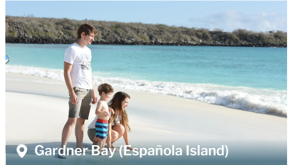
Gardner Bay (Española Island)

One of the most stunning beaches in all of the Galapagos. The long, white sandy beach, lapped by turquoise waters, is home to a colony of Galapagos sea lions. You may also spot Hood mockingbirds, endemic to this particular island. We can also snorkel here from the beach, in the shallow waters of the bay. Landing: wet