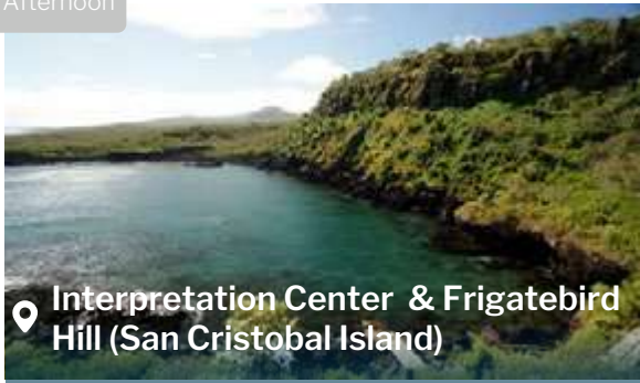
Interpretation Center & Frigatebird Hill (San Cristobal Island)

The interpretation center is full of interesting information and offers the perfect overview of the formation of the Galapagos. Following a hike to Frigatebird Hill (Cerro Tijeretas) we will have a great look at both species of frigatebirds, with the bonus of a beautiful view of the bay below. Landing: dry