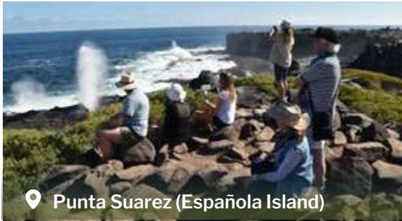
Punta Suarez (Española Island)

Punta Suarez is a naturalist's paradise. The oldest extant island in the archipelago is our only opportunity to commune with the endemic waved albatross during their breeding season, between April and December. With luck, we can watch their complex courtship display. Landing: dry