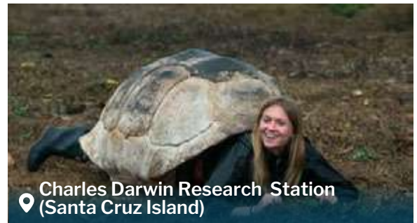
Charles Darwin Research Station (Santa Cruz Island)

Once home to the famous Lonesome George, the last tortoise of the Pinta race. The center is set in the Galapagos National Park Service where various interpretative buildings are available to visit. The grounds, with large stands of native vegetation are one of the better places to spot some of the seldom seen Darwin's finches. Landing: dry