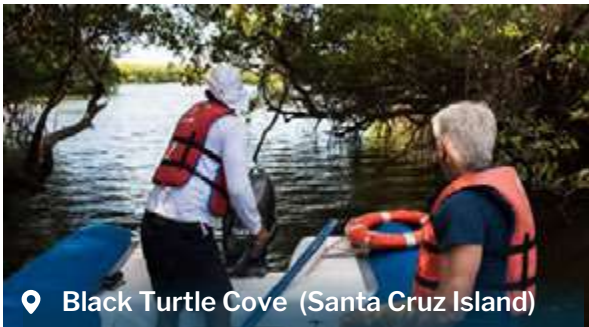
Black Turtle Cove (Santa Cruz Island)

Here we can find four species of mangrove in the extensive tidal lagoon system that stretches for almost a mile inland. During our panga ride through the labyrinth we will spot many turtles, herons of several species, sharks and rays. The experience is otherworldly and seems to transport us back to the beginning of time. Landing: N/A