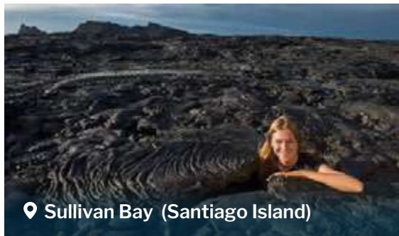
Sullivan Bay (Santiago Island)

It has an extensive features relative to young pa-hoe-hoe lava flows formed during the last quarter of the 19th century. In the middle of the lava flow, older reddish-yellow-colored tuff cones appear. Mollugo plants with their yellow-to-orange whorled leaves usually grow out of the fissures. Walking on solidified lava gives the impression of being on another planet. Landing: dry