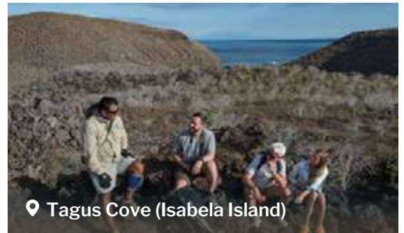
Tagus Cove (Isabela Island)

Tagus Cove, a historic pirate hideout and anchorage. Visited by Charles Darwin and the HMS Beagle in 1835. Hike past Darwin Lake and stunning volcanic landscape, revealing Isabela island's dramatic northern volcanoes. Snorkel along a submerged wall with turtles, fish, penguins, and flightless cormorants. Enjoy a panga ride or kayak for added excitement! Landing: dry