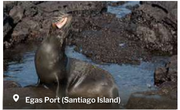
Egas Port (Santiago Island)

The black volcanic sand sets this landing apart from most, it's best known for the dramatic shoreline where we meet a host of species that chose to live between land and sea. Among these are the endemic Galapagos fur seals, which maintain a small colony at the end of our walk. Landing: wet