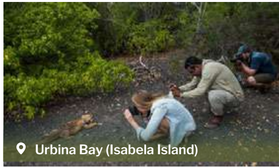
Urbina Bay (Isabela Island)

At the far end of a long level hike, we arrive at a strange phenomenon where large blocks of coral lie completely exposed after a dramatic geological uplift in 1954. Located at the western base of Alcedo Volcano, we hope to run into a few impressive land iguanas and some volcanoes endemic to Galapagos giant tortoises during the wet season. Landing: wet